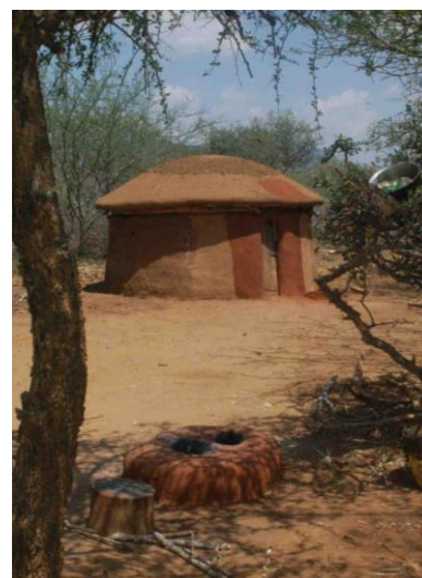
A traditional hut and fireplace. The roof is made of mud as raiders would set fire to thatch.