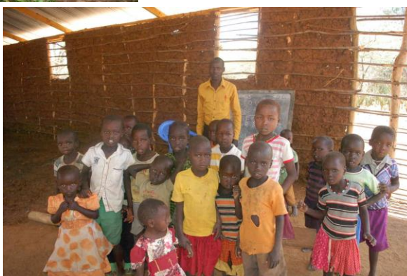
ECD = Early Childhood Development

Kapenguria is about 100 kms. south of our area of Pokot North, and is the main town for West Pokot County in which Pokot North is located. Here are medical, banking and tertiary educational facilities, as well as the County offices. We are praying for a mature couple to work in church planting here together with the few who presently gather each Sunday.