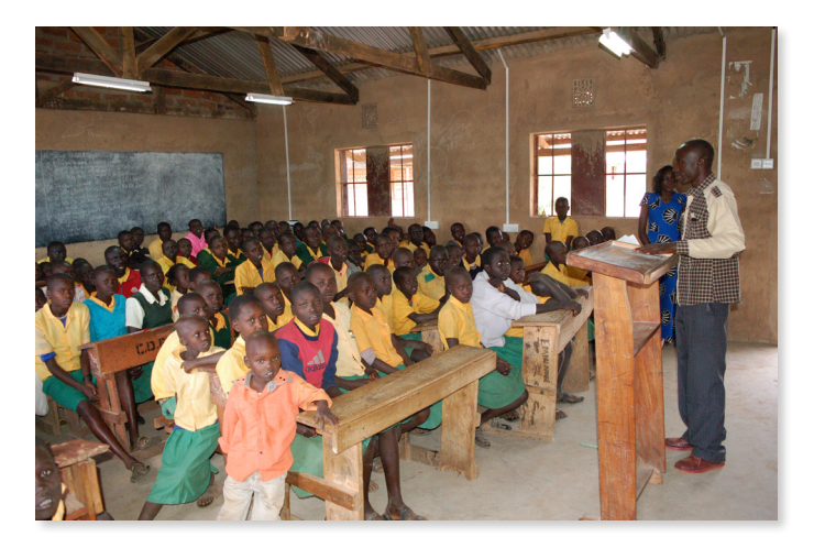
Preaching to Chepkinagh Primary