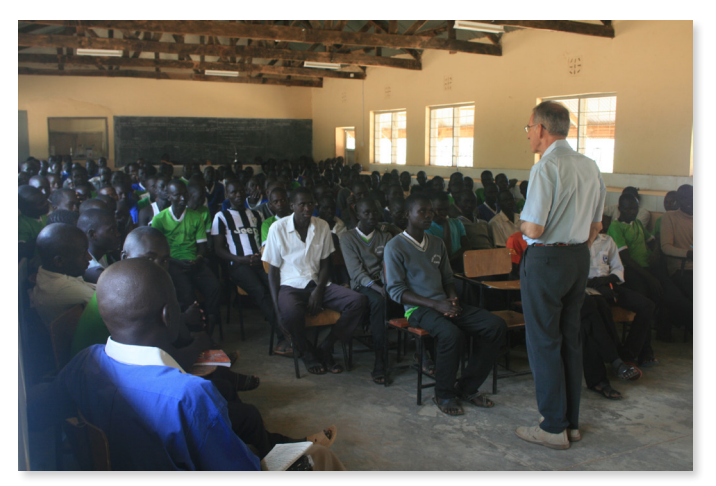
Preaching to Kasei Boys' High School

There are now 12 primary schools sponsored by Trinity Baptist Church in Pokot North with a couple of thousand children registered. There are also 2 secondary schools, Kasei Boys with 250 pupils, and Kamketo Trinity Girls with 40 (2016) but is developing. The Government does not have enough trained teachers for these growing numbers of schools so that we as a church are employing more than 30 teachers, plus the Chaplains. This is a great financial burden for the sponsoring church in Nairobi, Trinity Baptist Church. Although many in the community are quite rich in cattle, they have yet to see the great importance of education, especially for girls. We are praying that there will be more genuinely Christian teachers and so we are concerned to support those suitably qualified to train as teachers.