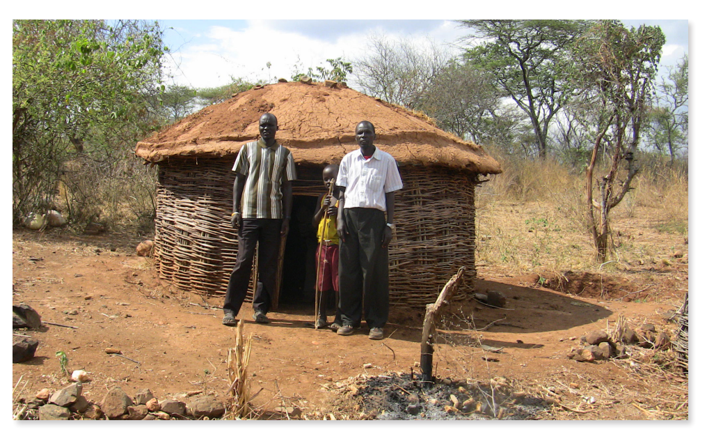
Traditional Pokot Hut