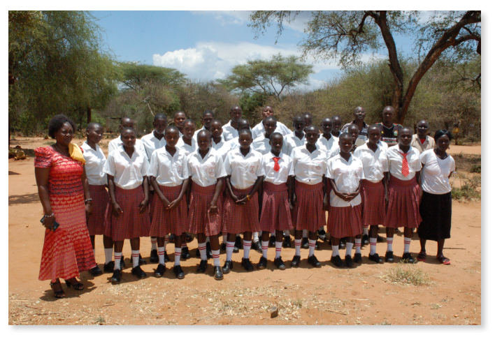
Kamketo Trinity Girls & Principal