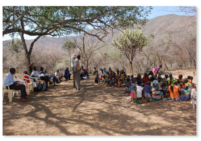
Preaching at Kwirir