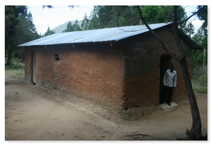
Tarakit Church building

3 local men have been trained in the Trinity Pastors' College in Nairobi, and get some support. One more is being trained. The brethren want to start their own Bible School so as to train those who cannot make it to Nairobi for one reason or another. So few have education and so lack a good knowledge of English. There are more than 150 baptized believers. Each year they organize large conventions for many hundreds of men, and women and youth. These are days of great opportunity, but the labourers are few. We have been able to send them 3 missionaries from within Kenya especially to help in ministering to the young people in schools where education is all in English.