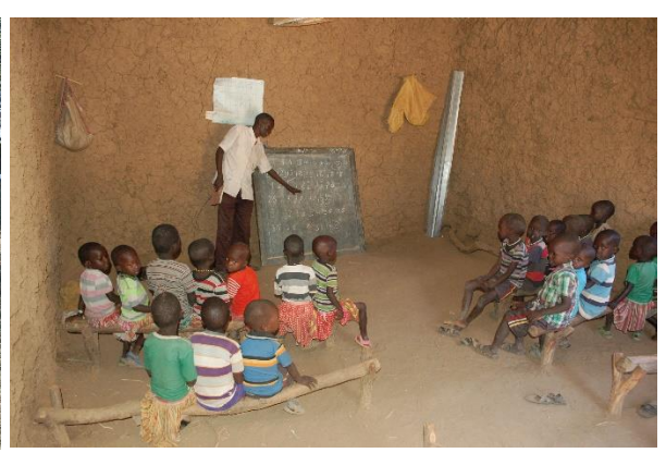
Early Childhood Development class - Kwirir