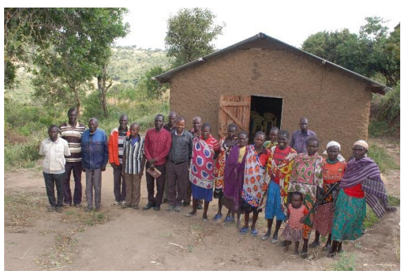
Kapkewa local church

(1) Other Churches. There are a total of 13 organized local churches. Chepkinagh also cares for Apur, Kapkoghun, Kapyomot, Kwirir, Nasorete, Tarakit, and Wasat; Kamketo for Kasepa; and Kasei for Kapkewa and Kapterema. To make the work easier all the churches get together for a joint service monthly. There are also separate retreats for men, women and youths. One very encouraging development is that many of the church members are taking advantage of the Adult Literacy programmes the County is putting in place all over the area. Surely every true Christian ought to desire to read the word of God for him or herself.