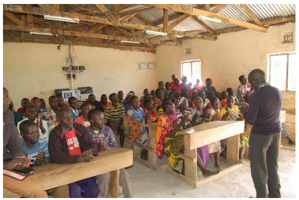
Kapkoghun members meeting in school classroom