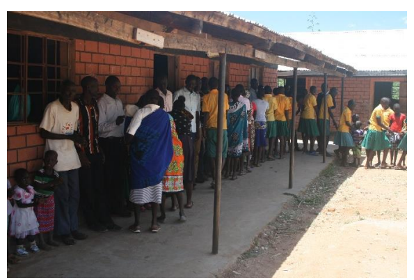
Chepkinagh greetings after service