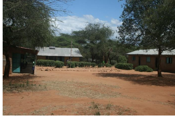
Classrooms - Kamketo