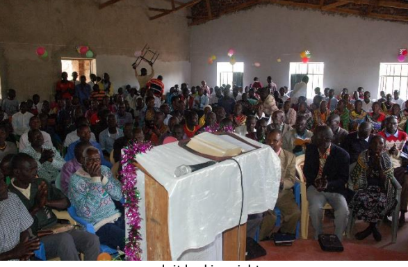
pulpit looking left