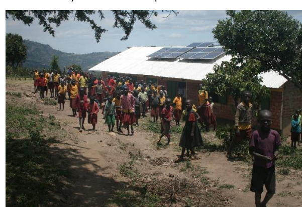
Classroom and students - Kapkewa

Perhaps a couple of thousand students are involved. Although the schools are run by the Government, as the sponsor TBC has opportunity in each to bring the word at assemblies, a designated class once a week, and to boarders after classes. Everywhere we went we were given the opportunity to preach to the students. We are praying that as the years go by the Head Teachers will at least be sympathetic to the church, if not members, and we will have helped to train genuine Christians to become teachers.